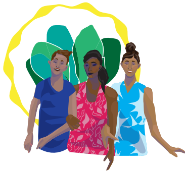
trans rights, safety & justice