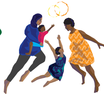
sexual and reproductive health, rights and justice