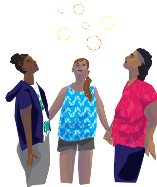
ending violence against women living with HIV

O ur vision is a world where all self-identified women living with HIV (WLHIV) can live long, healthy, and dignified lives, free from stigma and discrimination. Because the HIV pandemic globally and domestically has been propelled by racism, poverty, misogyny and intersectional stigma, we understand that achieving our vision requires an approach to policy advocacy that takes these factors into account while centering